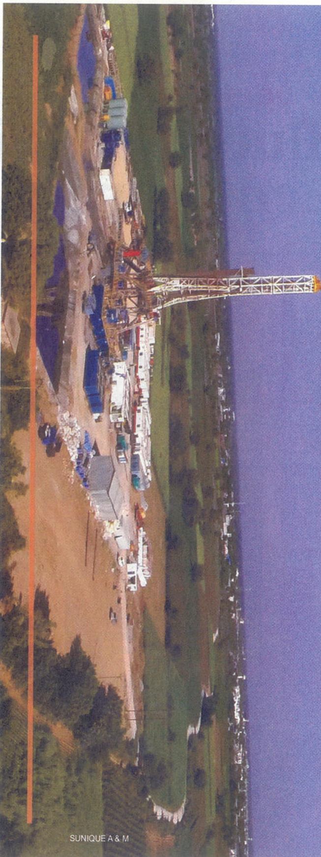
SUNIQUE A & M

An all-Indian company with whole-world perspectives.